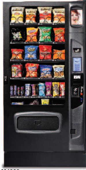
M4000 Shown with optional ADA door, iCart touch screen & kick panel.

Shown with optional ADA door, custom door color & kick panel.