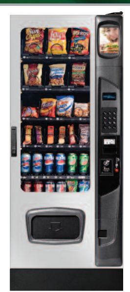
Shown with silver ADA door and optional kick panel options.