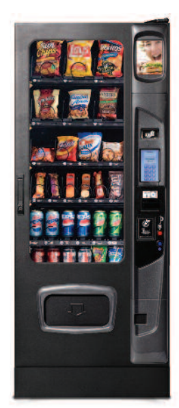
Shown in black with ADA door. iCart touch screen, automatic delivery assist and kick panel options.